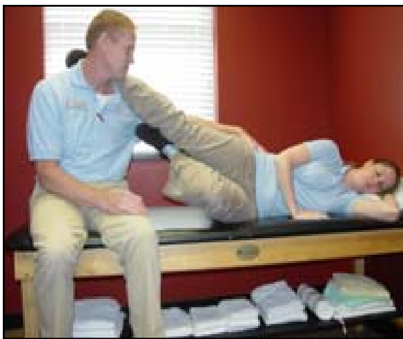
Normal L FA IR

The patient may appear to succeed during the attempt of achieving a Level 2 score on the right HADLT by raising the lower knee off of the exam table, but may not truly have a score of 2/5. When attempting to raise the lower knee, the patient might not actually internally rotate the left lower extremity (FA IR), but instead flexes the left LE (FA flexion). This engages the left psoas (not anterior glute medius and IC adductor) which is part of the Left AIC. Remember, the examiner is actually trying to see if the patient can inhibit that Left AIC during this portion of right HADLT testing. So if the left FA joint flexes, the patient is unable to inhibit the Left AIC while attempting to activate the left anterior glute medius along with the left IC adductor. A score of 1 must be given, since the patient is unable to rotate the left LE off of the table (left FA IR).