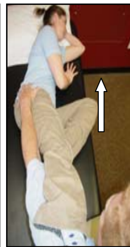
Aberrant L FA Flexion