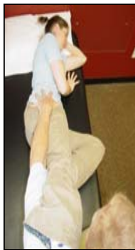
Normal L FA IR